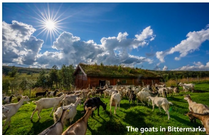
The goats in Bittermarka

It is also a tip to follow Trysil municipality (Trysil kommune) on Facebook. They are good at posting messages about culture and things going on.